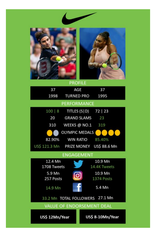
Data as on 25th March 2019

There is an argument that men's sports and male athletes should make more through sponsorships and endorsements than their counterparts on the grounds that they generate more money for their respective sports. However, even when women raise more money than men, they are still receiving less. Take for example, the US women's soccer team, ranked number one in the world and currently 23 places above the men, generates on average nearly US $20 million more in revenue for the US Soccer Federation than the men's team, but receives a significantly smaller share of the Federation's sponsorship money than the men.<sup>1</sup>